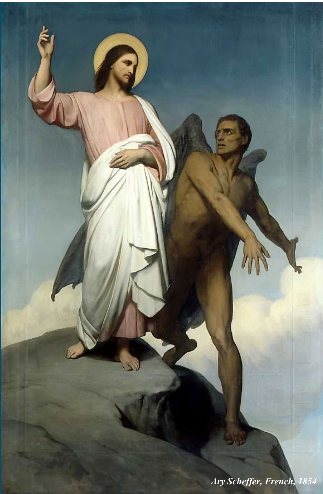
Ary Scheffer, French, 1854

"YOU SHALL NOT PUT THE LORD, YOUR GOD, TO THE TEST."