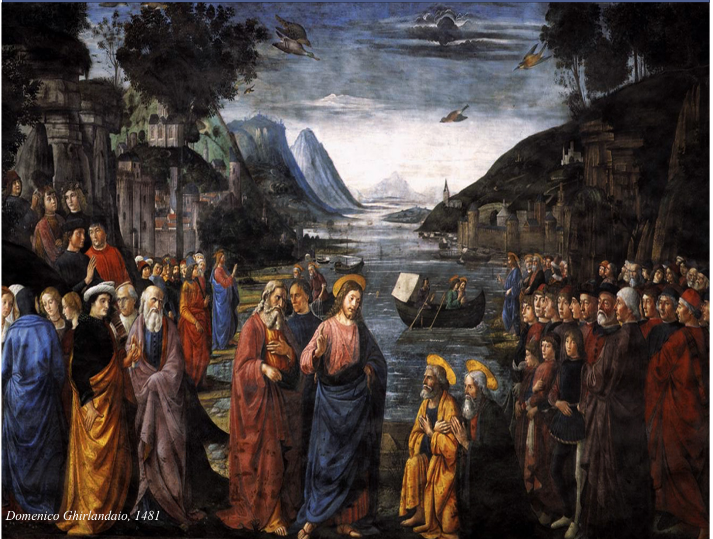
Domenico Ghirlandaio, 1481

"Do not be afraid; from now on you will be catching men." (Luke 5:1-11)