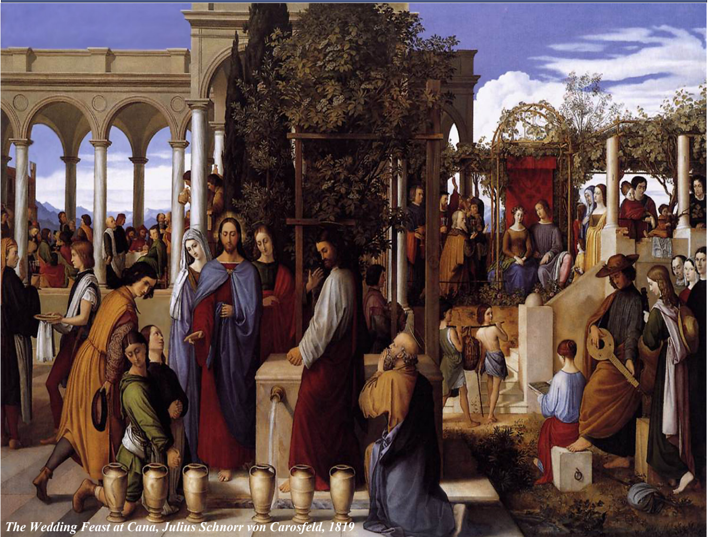
The Wedding Feast at Cana, Julius Schnorr von Carosfeld, 1819