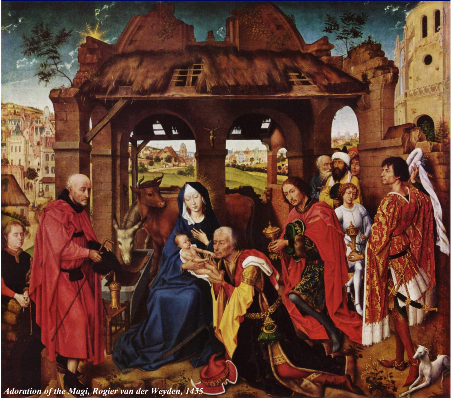
Adoration of the Magi, Rogier van der Weyden, 1455