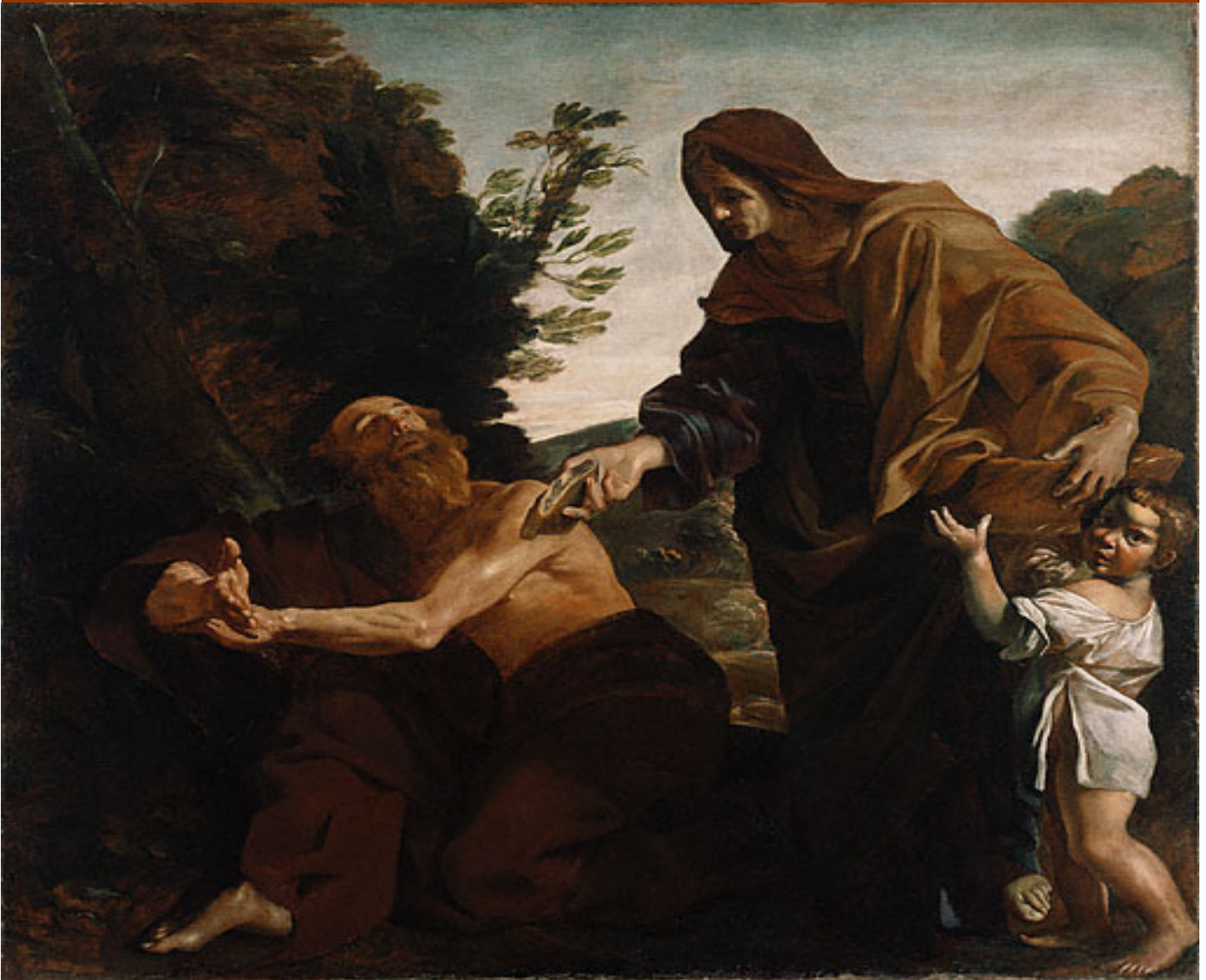
Elijah Receiving Bread from the Widow Of Zarephath, Giovanni Lanfranco, Rome 1621—1624