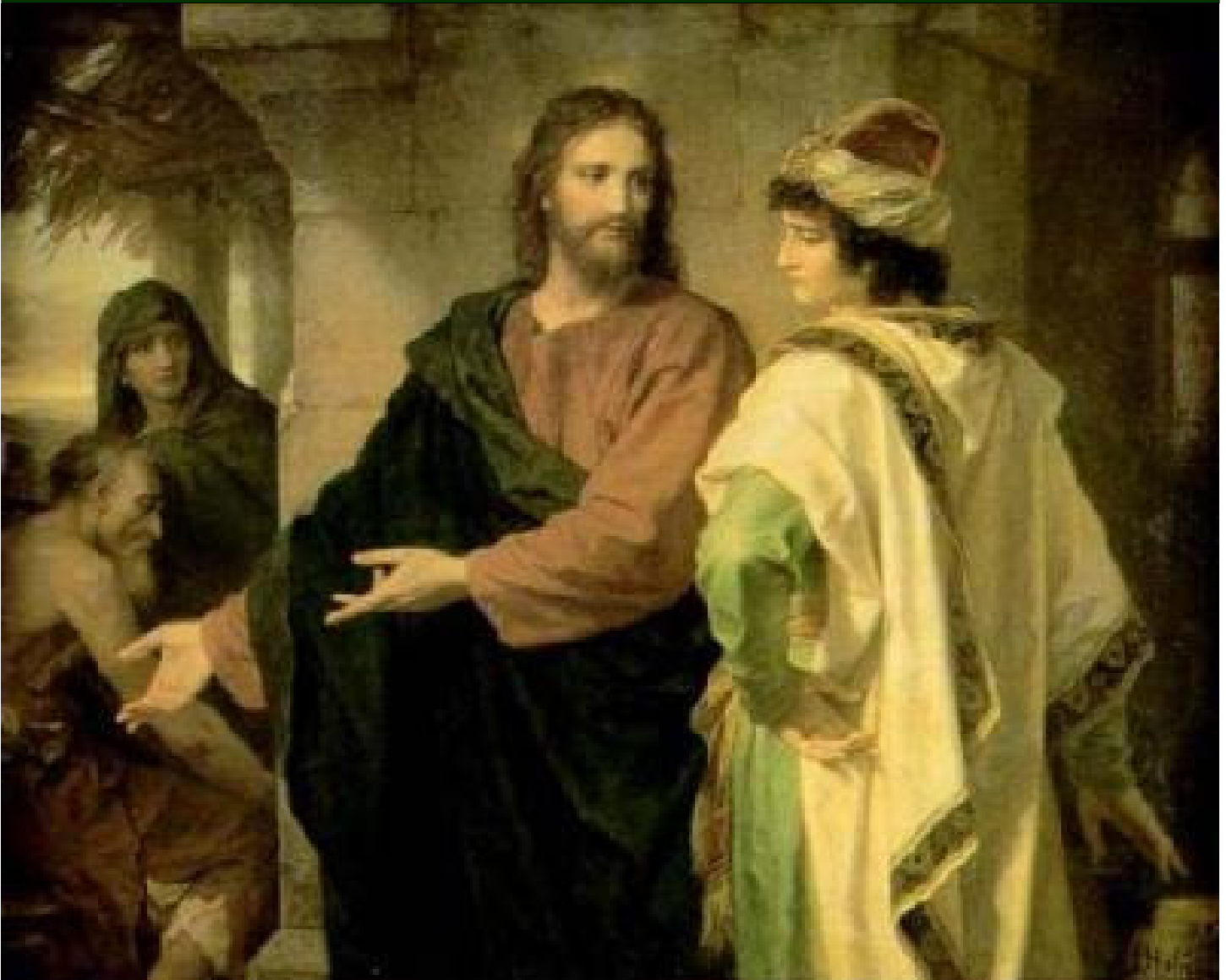
Christ & the Rich Young Ruler—Heinrich Hofmann, 1890

... "What must I do to inherit eternal life?" - Mark 10:17-30