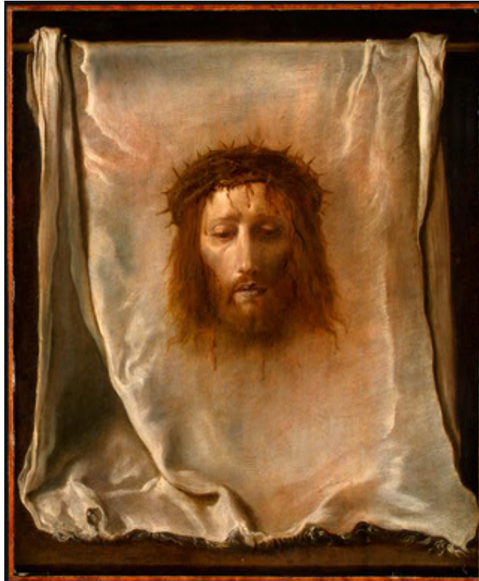
“Veil of Veronica” by Domenico Fetti, c.1618-1622

Office: (650) 588-1455 Website: stveronicassf.com