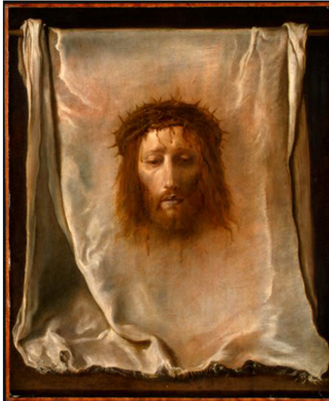
“Veil of Veronica” by Domenico Fetti, c.1618-1622

Office: (650) 588-1455 Website: stveronicassf.com